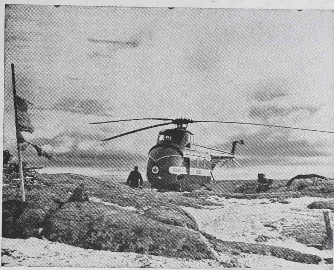
RADIO EQUIPMENT IS LOADED in a Sikorsky atop a rocky hill where a detection station of the Mid-Canada line will stand. The RCAF helicopter crew flew in the equipment to test for a suitable signal and this accomplished, they move on to another location, leaving the tattered flag as mute evidence that a detection unit will take form there. Only faint traces of snow had fallen when this photo was taken.

real and other parts of the province, and the Association feels that such tangible support as is being offered in the present case will arouse and encourage even greater activity among the youngsters in the "roarin' game". Due to the sponsorship of the