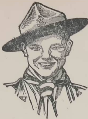
1st D'ville Troop

Last Friday, February 12th, the Boy Scouts held their meeting in the school basement with twenty-two boys present.