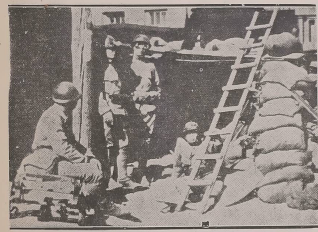
To make sure of their newly-gained territory in China the Japanese forces lost little time in setting up fortifications at all important centers...